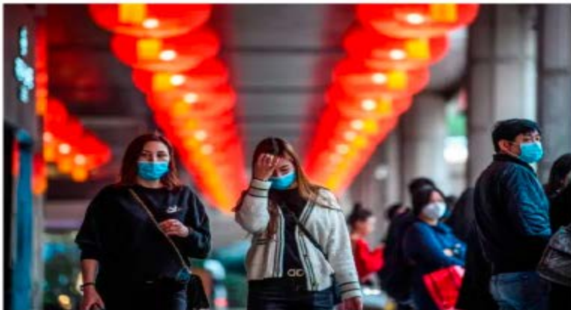
Pedestrians wear face masks as they walk outside the New Orient Landmark hotel in Macau on Jan. 22, 2020.

BY STEPHEN M. WALT | MARCH 9, 2020, 5:20 PM