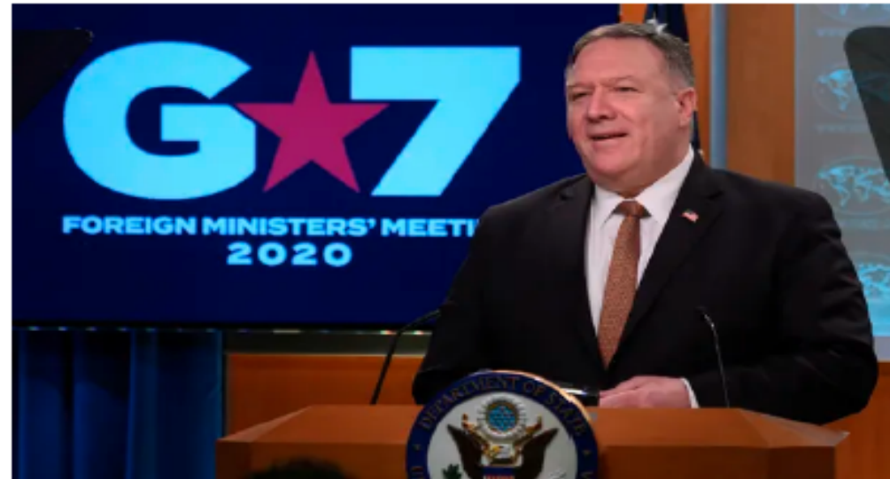
▲ US secretary of state Mike Pompeo has blamed China for the coronavirus pandemic.

When the UN security council and the G7 group sought to agree a global response to the coronavirus pandemic, the efforts stumbled on the US insistence on describing the threat as distinctively Chinese.