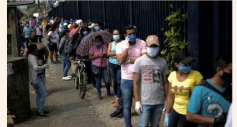
People queue outside a shopping centre in Guayaquil, Ecuador, on Thursday

Investors sceptical of bid to help ease economic and health hit of coronavirus