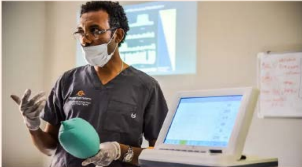
A medic teaches doctors how to use ventilators to treat coronavirus patients in Addis Ababa, Ethiopia. If the disease is not beaten in Africa, it will return to haunt us all

World leaders call for an urgent debt moratorium and unprecedented health and economic aid packages