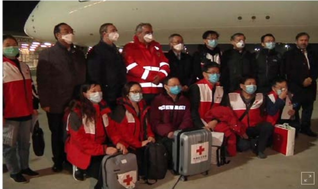
A Chinese team of experts pose for a photograph with head of the Italian Red Cross Francesco Rocca after arriving at Rome's Fiumicino airport on a chartered plane with a consignment of medical supplies including respirators and masks, to help Italy cope with a coronavirus outbreak, in Rome, Italy, March 12, 2020 in this still image taken from video March 13, 2020.