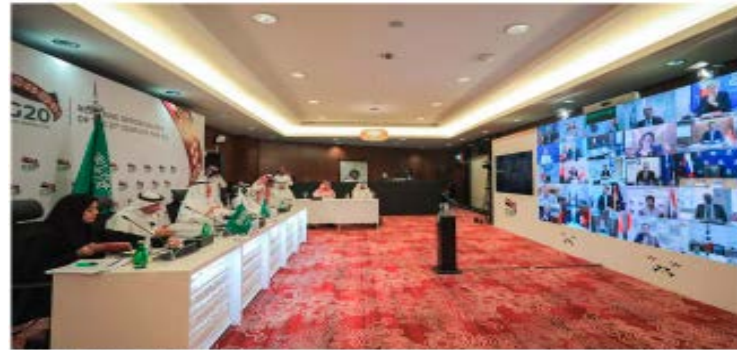
A Facebook photo released by the Saudi Energy Ministry on April 15, 2020 shows Saudi Arabia's Energy Minister Abdulaziz bin Rabiah (left) sharing a virtual extraordinary meeting of G20 G20 members, in the capital Riyadh.

Issued on: 15/04/2020 - 14:52 Modified: 15/04/2020 - 14:52